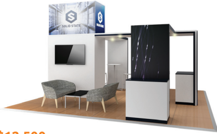
$12,500 Trinity 9873 $12,500

Pricing includes Flooring, Furniture, Lighting and Audio Visual screens (where applicable)