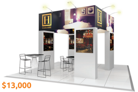
$13,000 Marlo 9373 $13,000