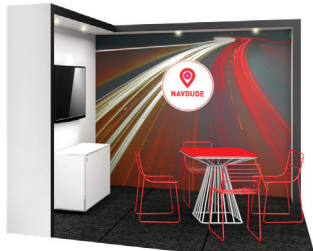
$6,400 Portsea 9151 $6,400