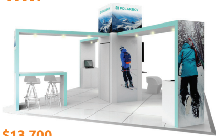
$13,700 Strand 9573 $16,900