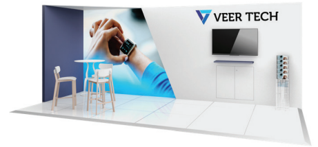
$7,750 Burleigh 9762 $7,750