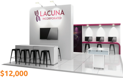
$12,000 Hamilton 9772 $12,000