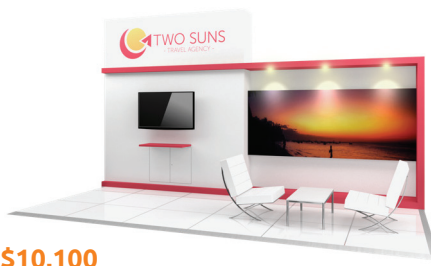
$10,100 Sorrento 9661 $10,100