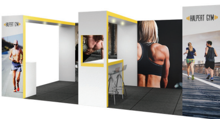
$9,500 Bondi 9462 $9,500