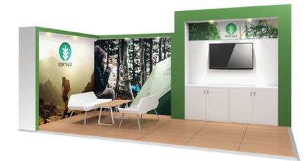
$11,500 Gibson 9361 $11,500