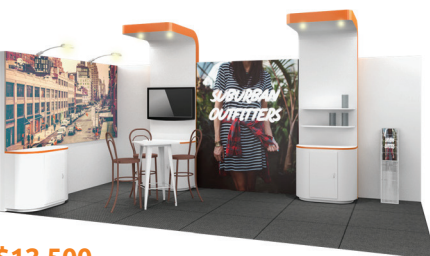
$12,500 Brighton 9261 $12,500